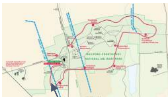
Arthur Forbis Monument